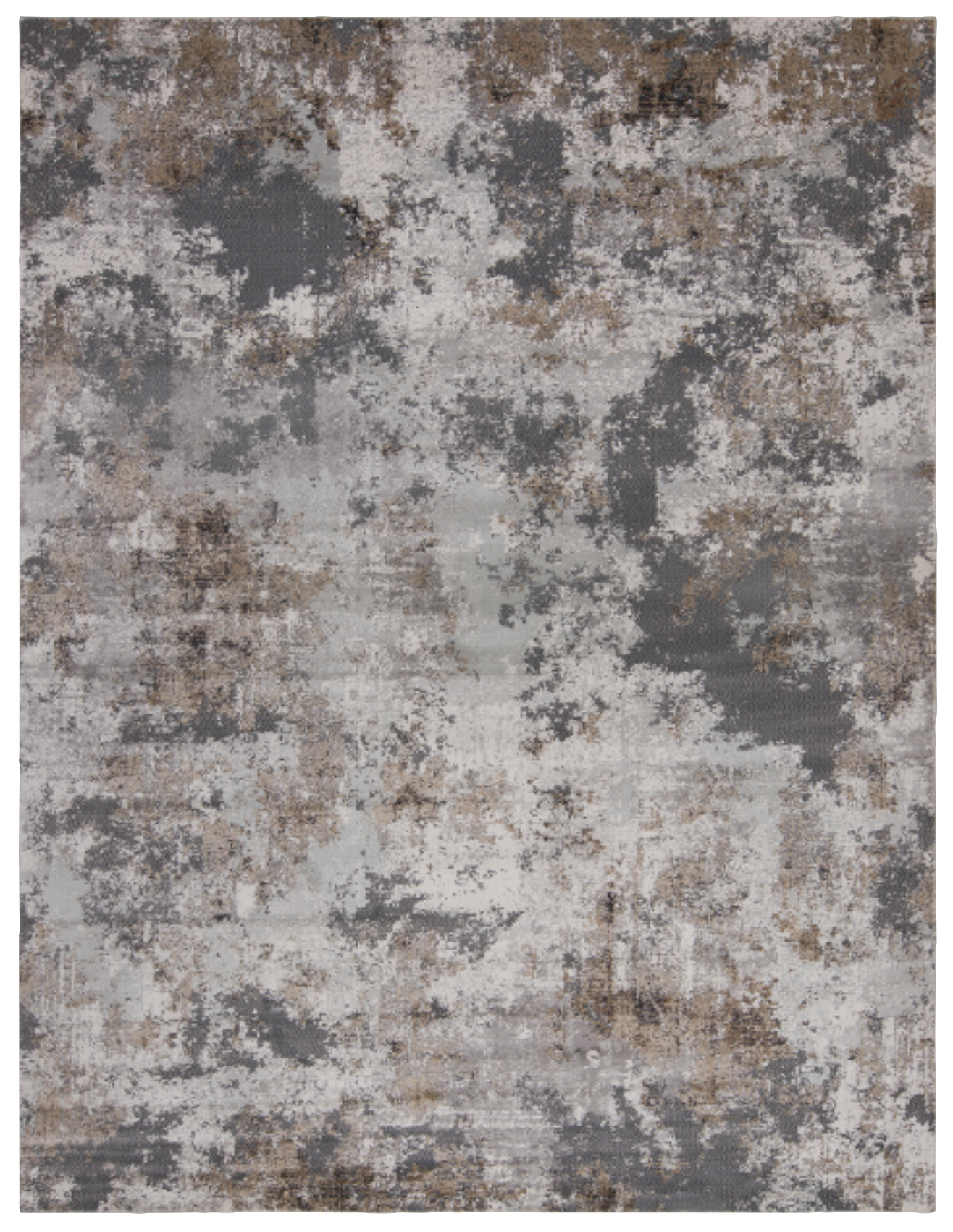
S10-11B Grey - Bronze