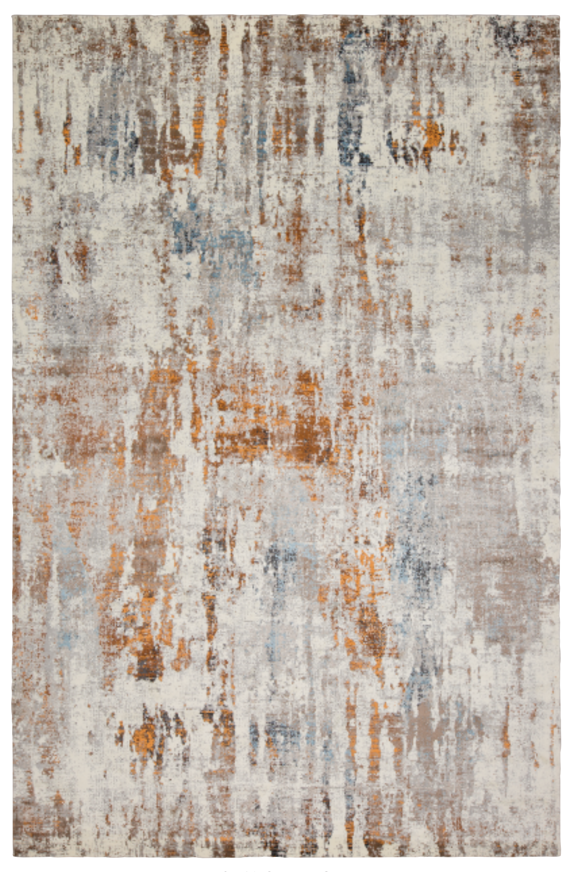
S6-03 Cream - Grey