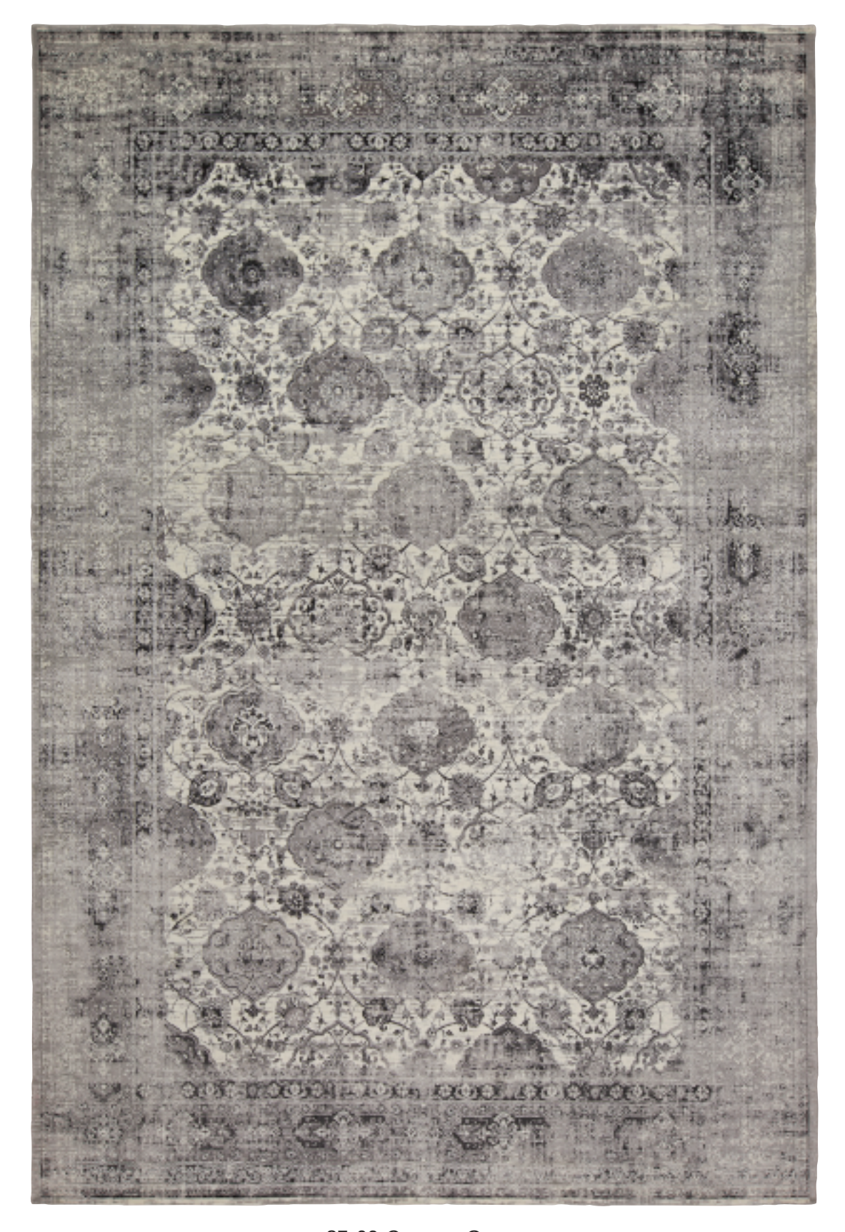
S7-03 Cream - Grey