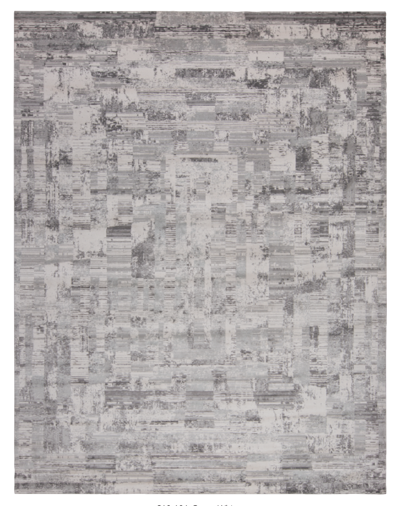
S10-10A Grey - White