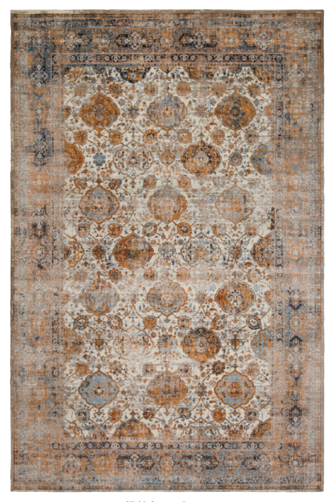
S7-03 Cream - Beige