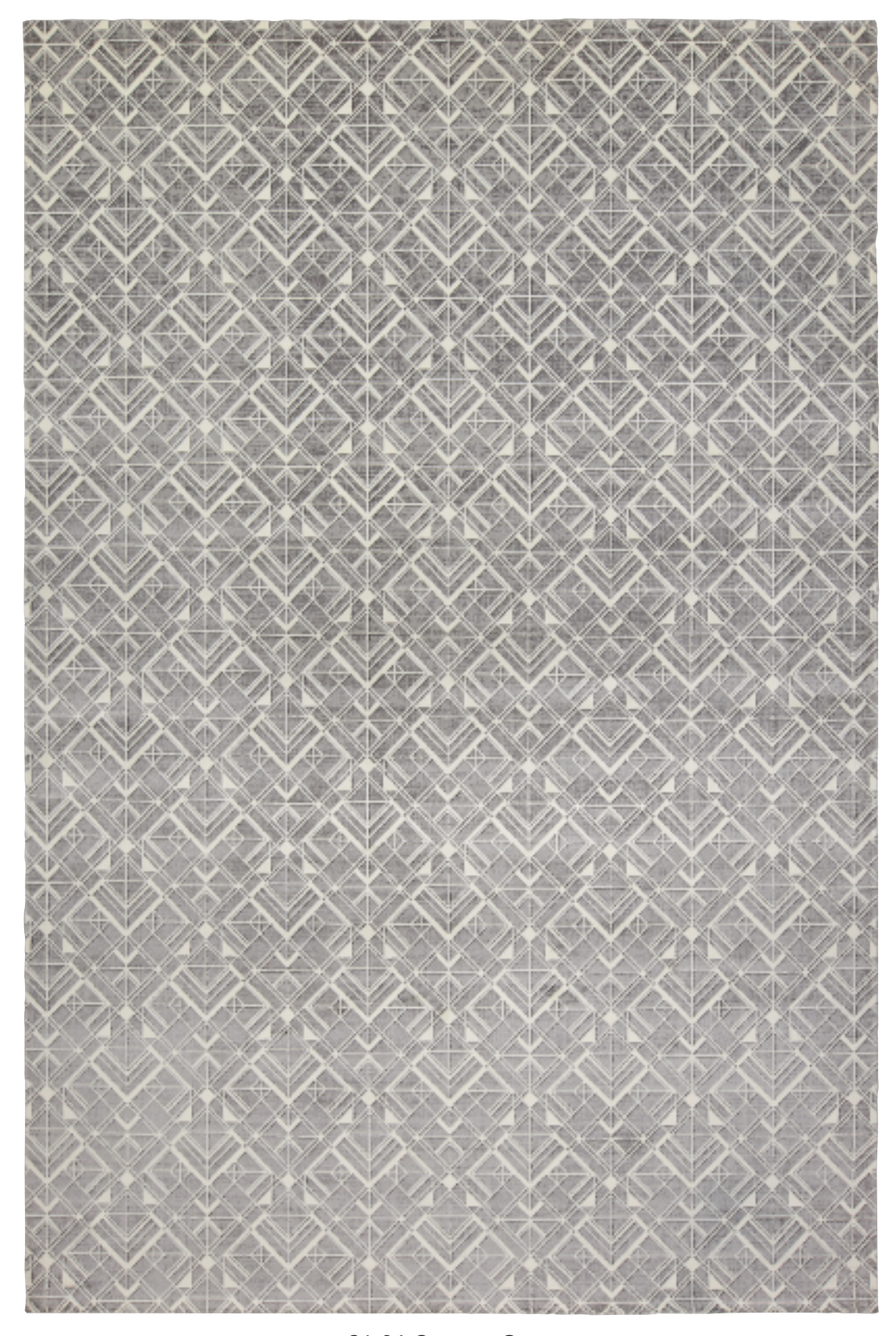
S6-04 Cream - Grey