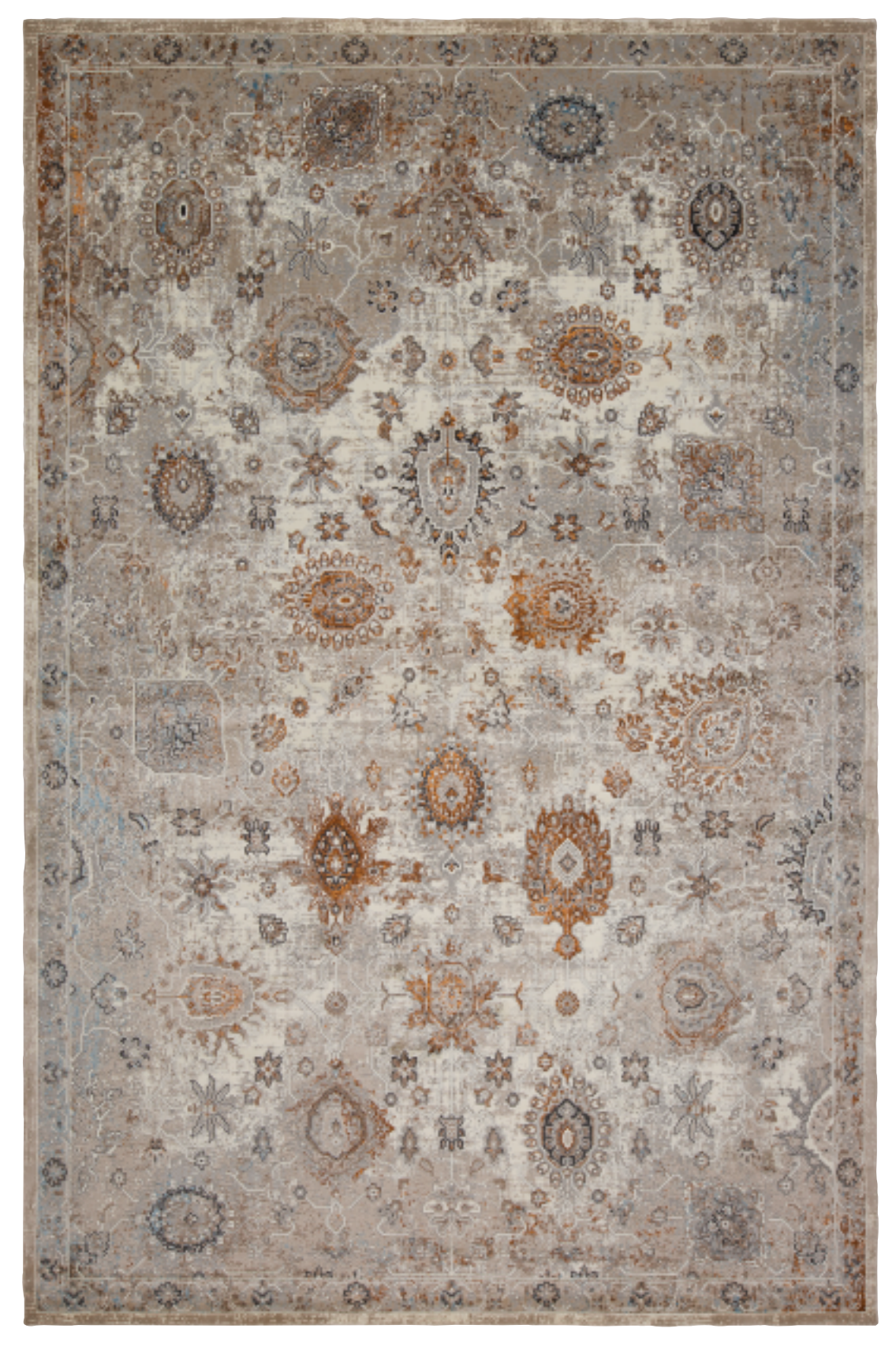
S7-01 Cream - Grey