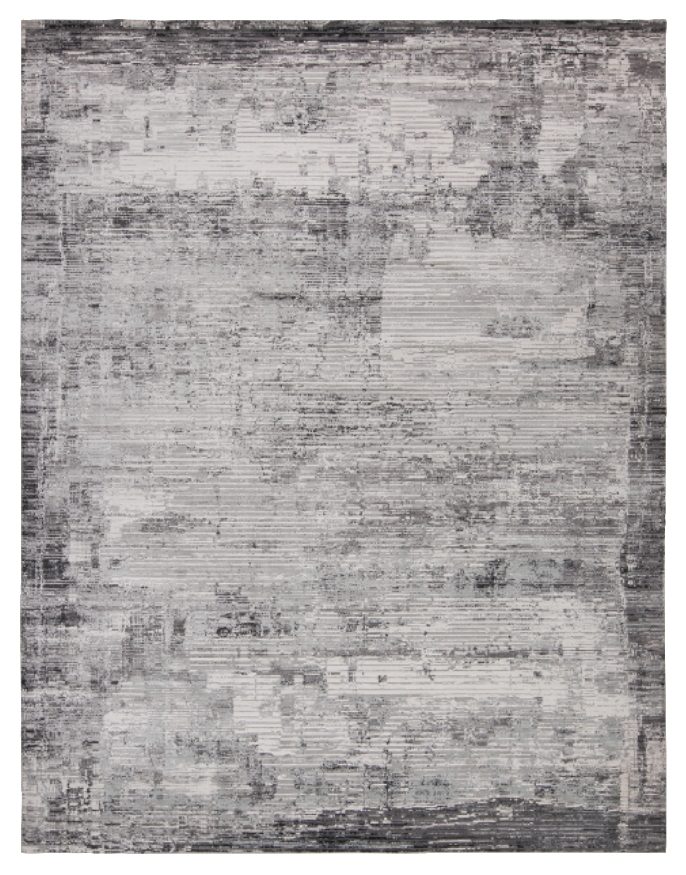
S10-16D White - Charcoal