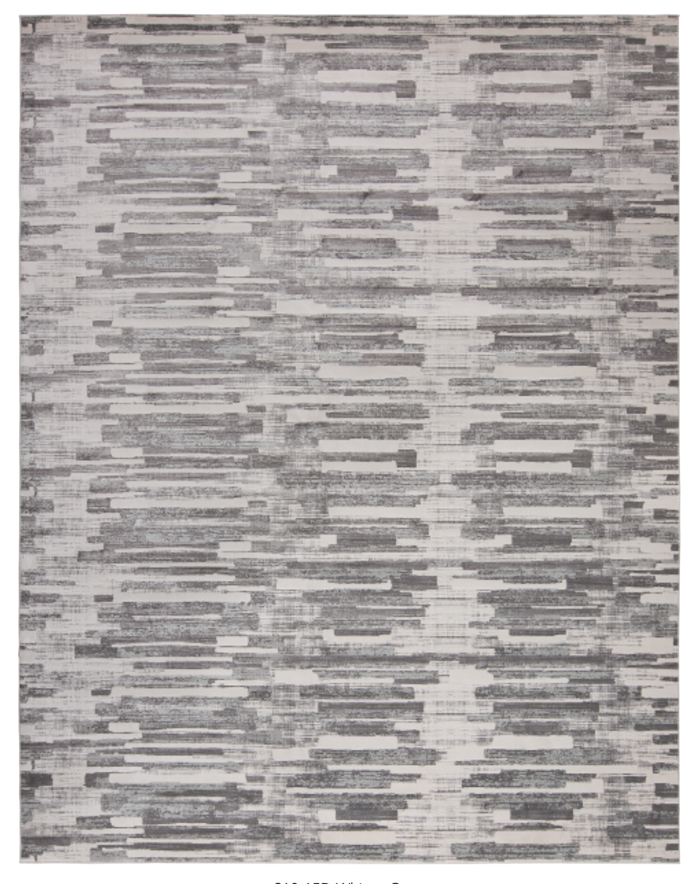
S10-15D White - Grey