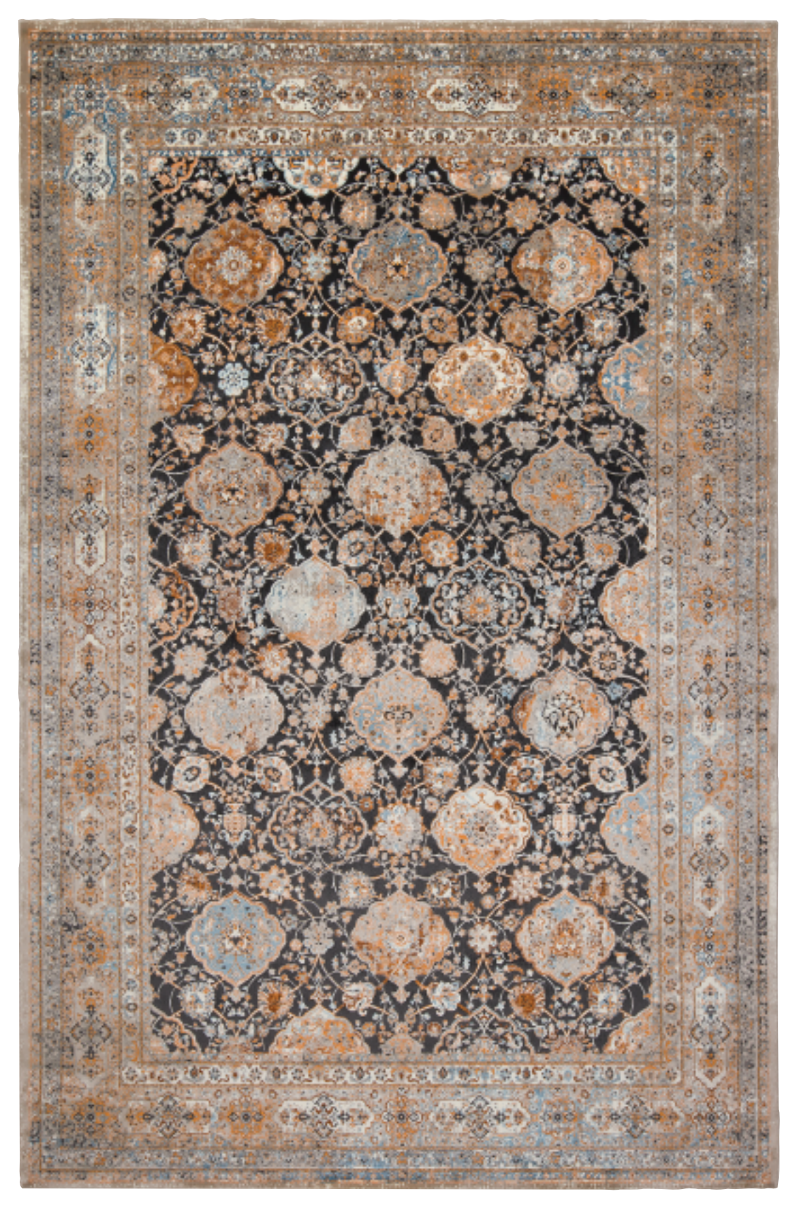
S7-03 Charcoal - Bronze