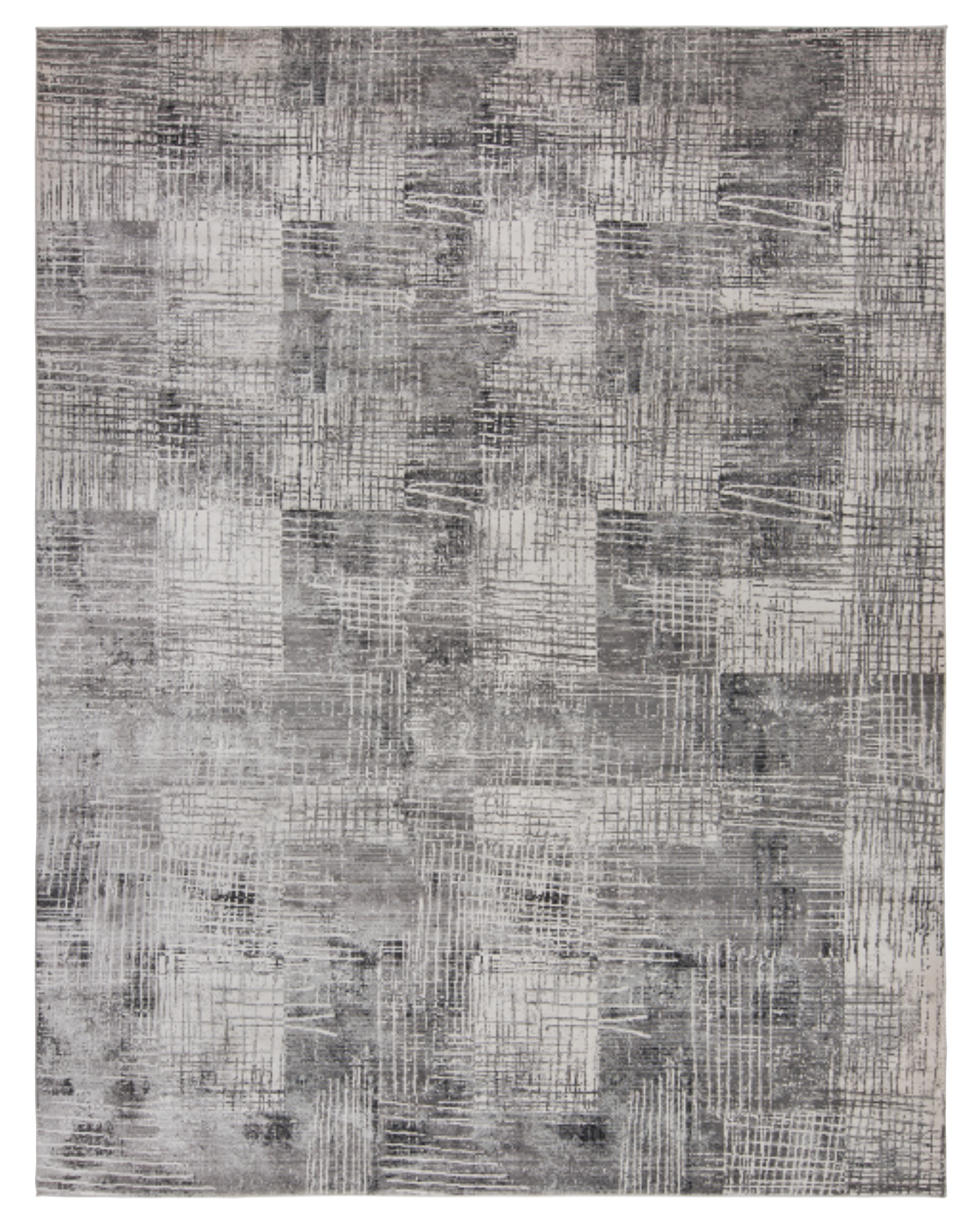
S10-13D Silver - Black