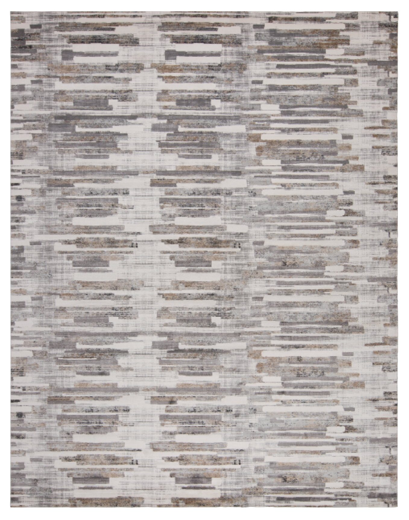
S10-15B Stone - Bronze