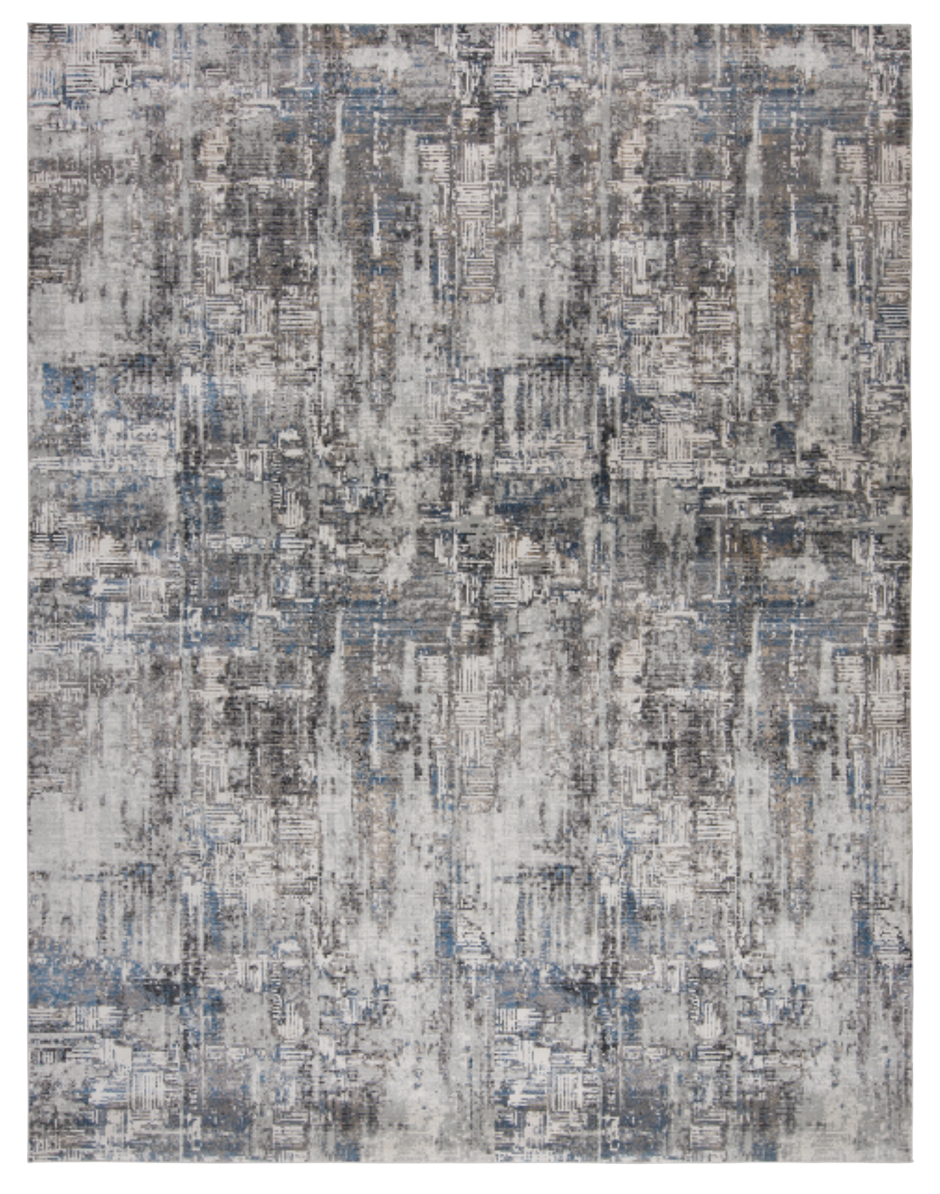
S10-17C Slate - Blue