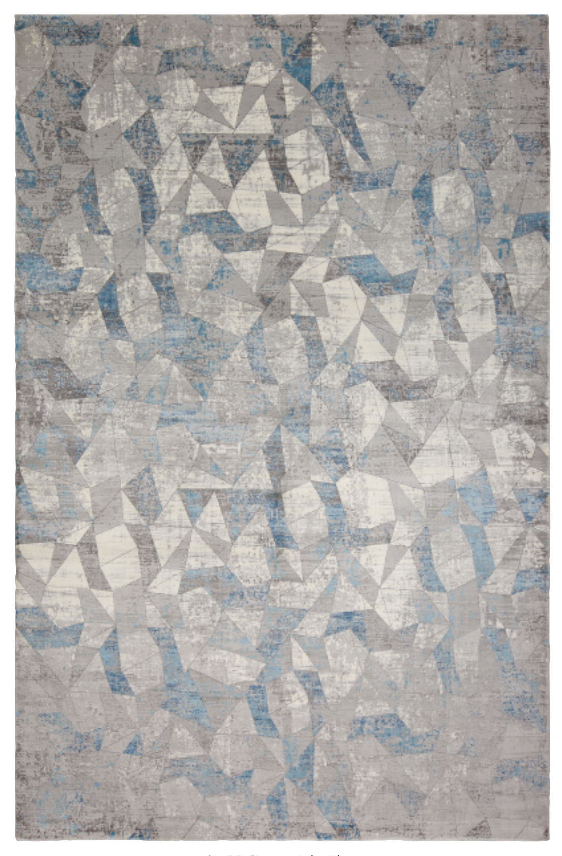
S6-01 Grey - Light Blue