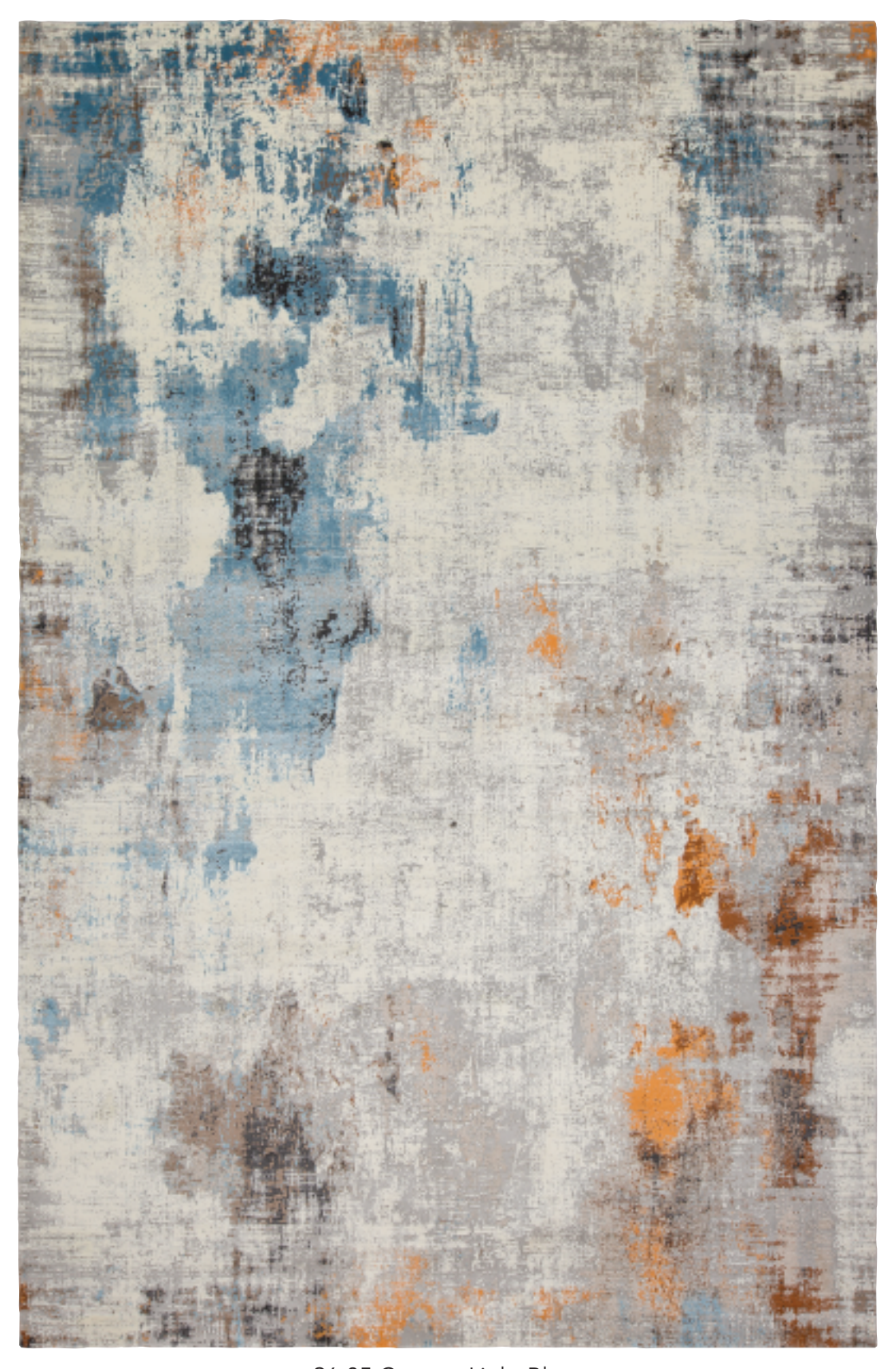
S6-05 Cream - Light Blue