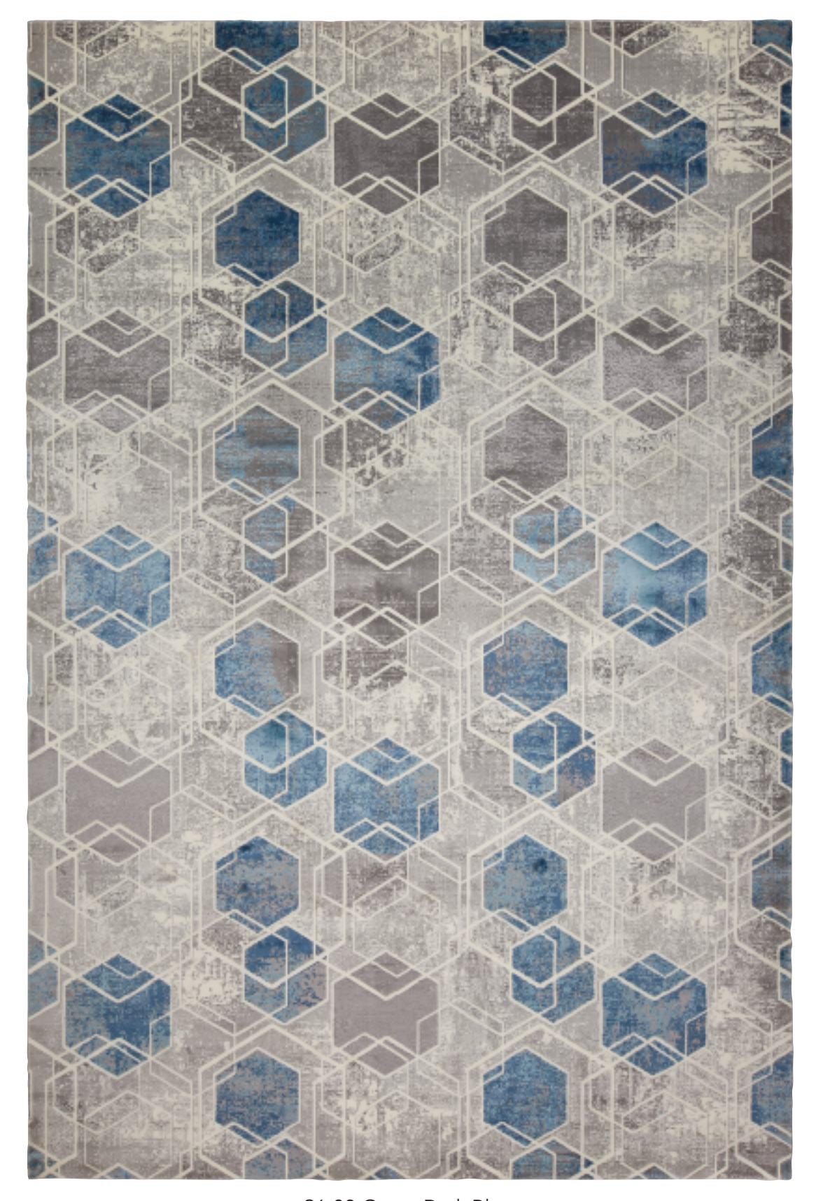
S6-02 Grey - Dark Blue