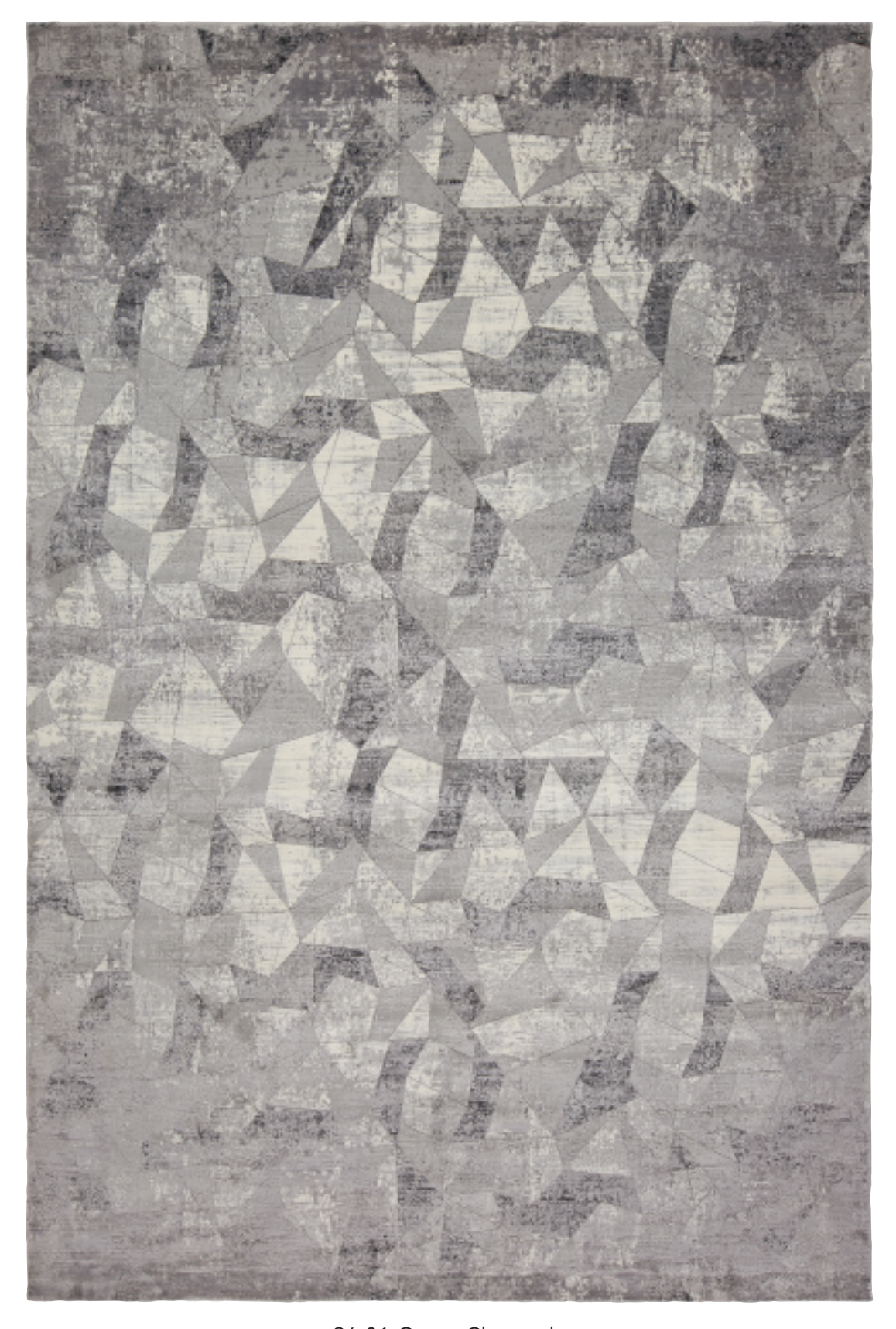
S6-01 Grey - Charcoal