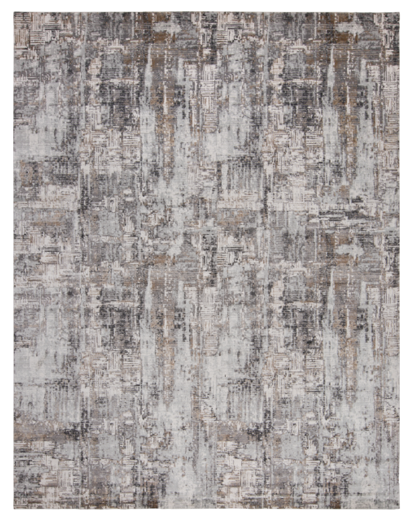
S10-17B Bronze - Stone